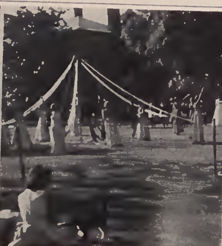
May Court winds the May Pole