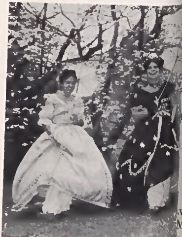
Two Belles of St. Mary's