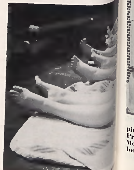
Sun porch . . . with sun & no