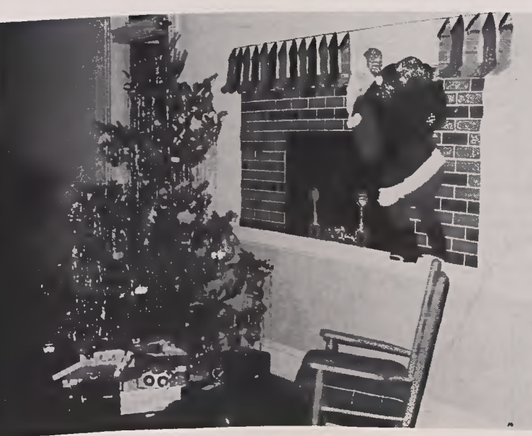
"Twas the night before Christmas . . ."