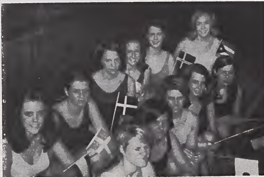
The 1967-68 St. Mary's Sea Saints.