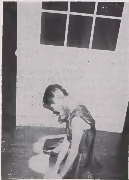
"Little Match Girl"