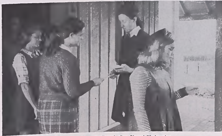
Honor Codes were distributed after Chapel Wednesday.

It will be presented to the public on Monday, November 24, and