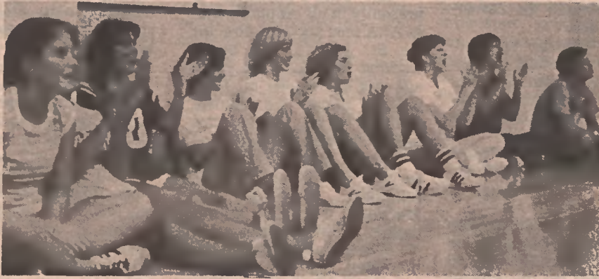
Students cheer their teammates to volleyball victories.