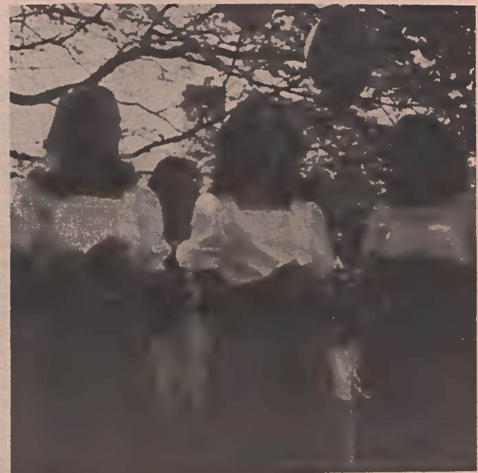
May Court 1982