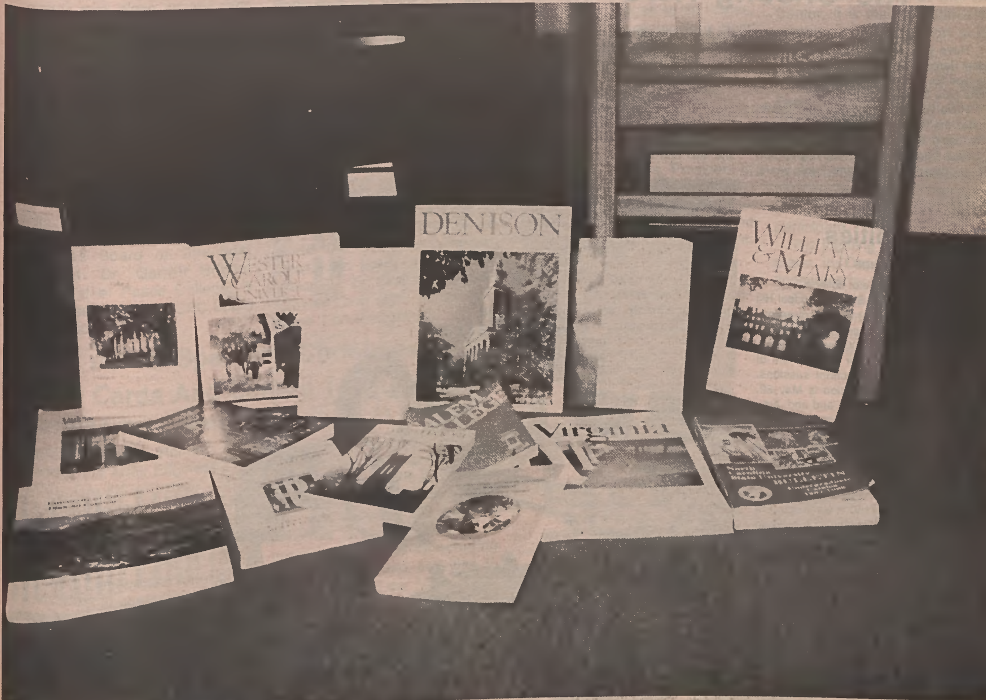
Farewell to students planning to move on.