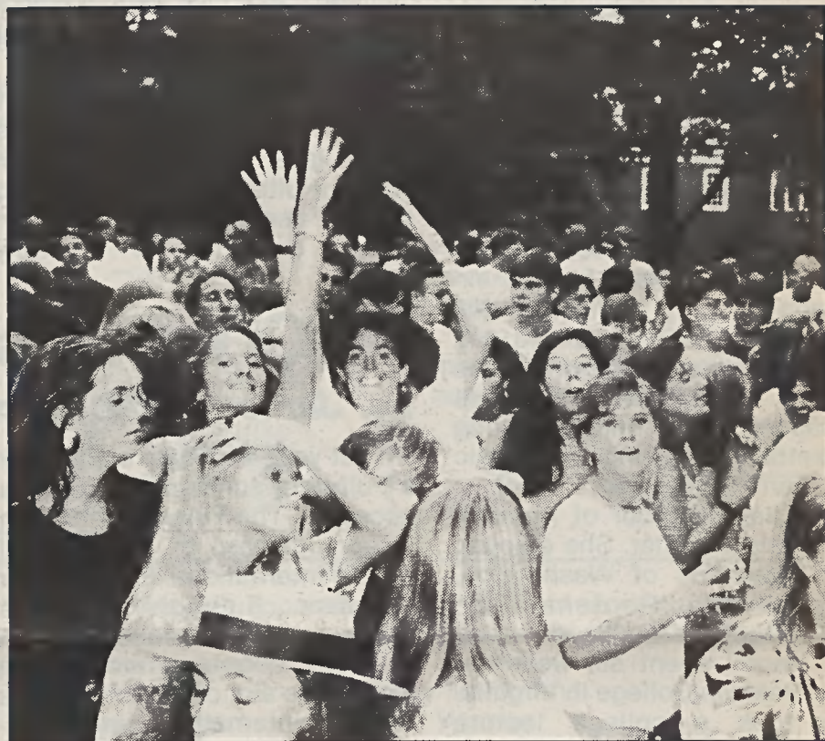
Faces in the crowd at the Indecision concert

Events such as this will definitely be part of the future of Saint Mary's College. For more information about when Indecision is playing write: Indecision Booking and Information, PO Box 5046, Charlottesville, VA 22905, (804) 296-0974.