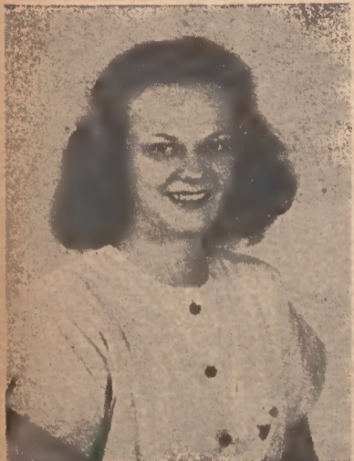
Minor for Piano and Orchestra," according to notification from Dr. the above-named Concerto to the students during the chapel period.