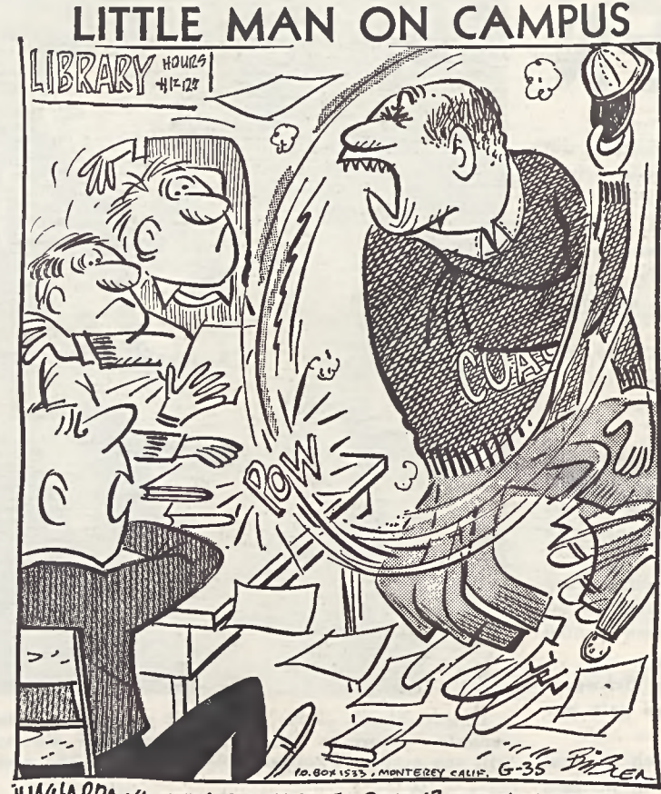
WHAPDA-YA-MEAN YOU HAVE TO STUDY? DID YOU COME HERE TO STUDY OR PLAY FOOTBALL?"