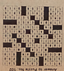
Answer to Puzzle No. 102