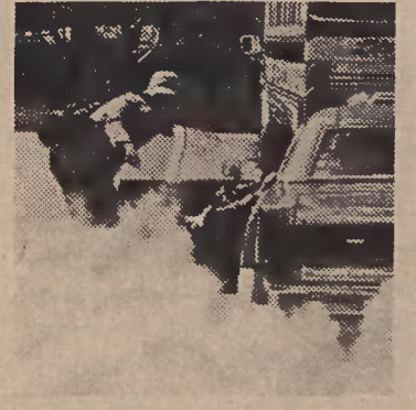
People start pollution. People can stop it.

Don't close your eyes. Point it out to someone who can do something about it.