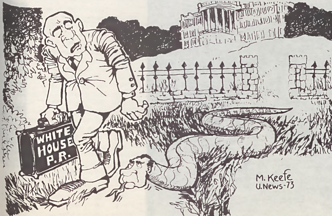
"We've got to do something about this image of yours..."