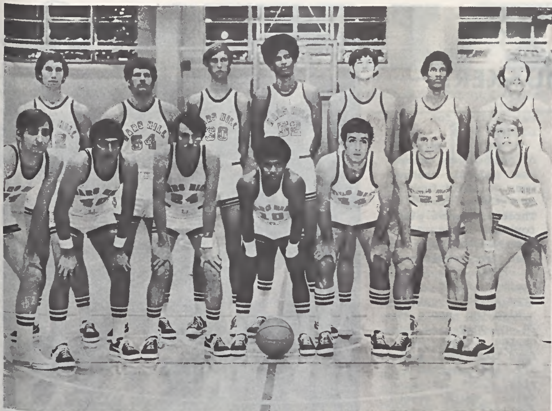
Cagers enjoy brief respite before scrimmage