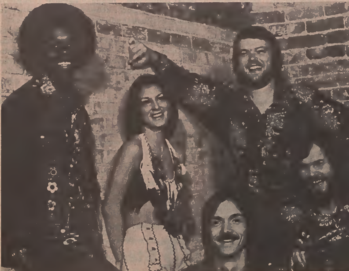
SHILOH MORNING to perform on April 9 at 8:00 p.m. behind Moore.

SHILOH MORNING will perform behind Moore Auditorium at 8:00 p.m. on April 9. The admission is free to all Mars Hill students.