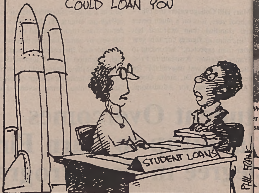
© CREATIVE MEDIA SERVICES Box 5955 Berkeley, CA. 94705

I'M AFRAID OUR FEDERAL STUDENT AID FUNDS HAVE BEEN CUT OFF BUT THE PENTAGON HAS SENT OVER A COUPLE OF OUTDATED CRUISE MISSILES I COULD LOAN YOU