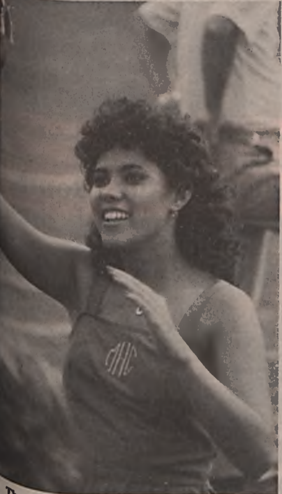
The Cheerleaders kept spirit at record highs during the game.