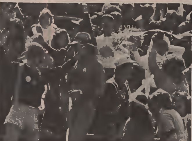
The "Hill Raisers" marked the return of what had been thought an extinct breed of fan at Mars Hill Games.