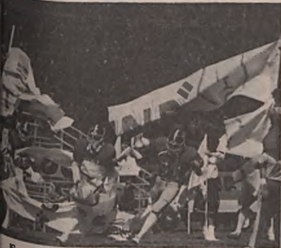
Excitement was high as the Lions made their first home appearance.