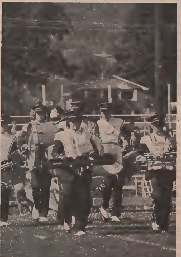
The Mars Hill Marching Band delivered an impressive premiere half-time show.