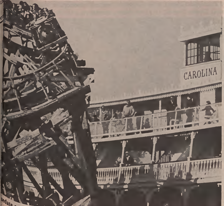
The Goldrusher on the left is a roller coaster with trains dipping and twisting over a 2,400-ft. of curved steel track. The Carolina sternwheeler takes guests for a leisurely cruise along a lagoon in the center of the park.

Admission to the park is $11.95 for everyone over four years of age except senior citizens who are admitted for $9.95. Those under three are admitted free and for groups of 25 or more, special rates are available. Call 704/588-2600 for additional information.