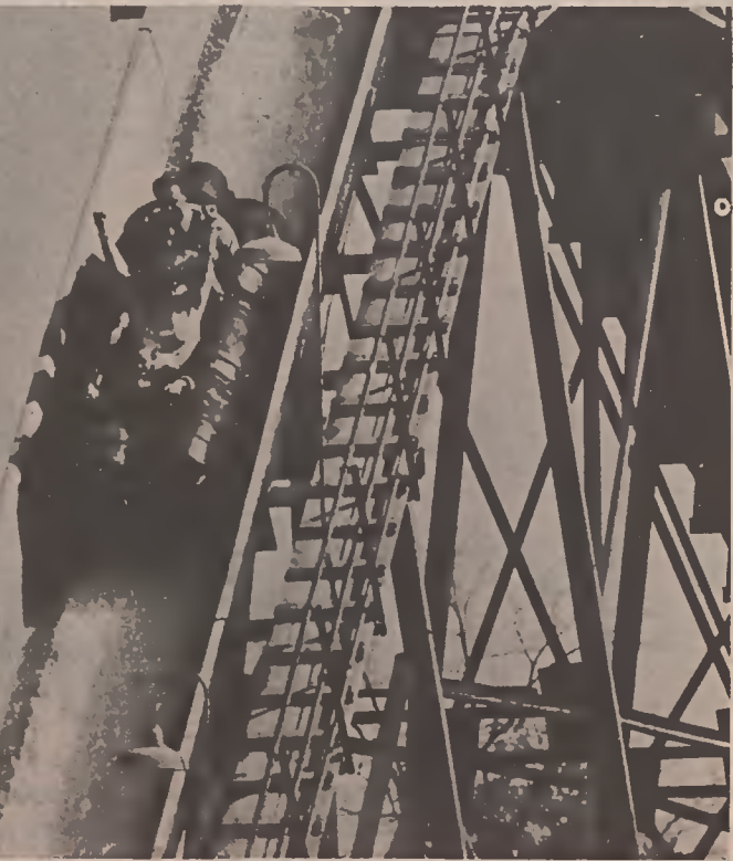
Plunge down a water trough and a cool splash landing makes the Powder Keg roller coaster at Carowinds one of the most popular rides in the 77-acre theme park.