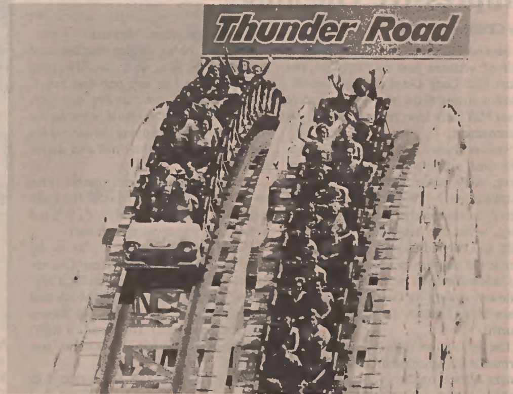
The giant twin-racing Thunder Road roller coaster at Carowinds challenges thrill seekers to ride over one and one-fourth miles of wooden track at speeds up to 60 miles per hour after a sheer 49° drop from a 91-ft. incline.

high school and college students on a seasonal basis, and has 103 permanent employees. During the fall, the park will be open the first two weekends in October and then beginning November 25 and running through December 31, the park will be open every day celebrating Winterfest.