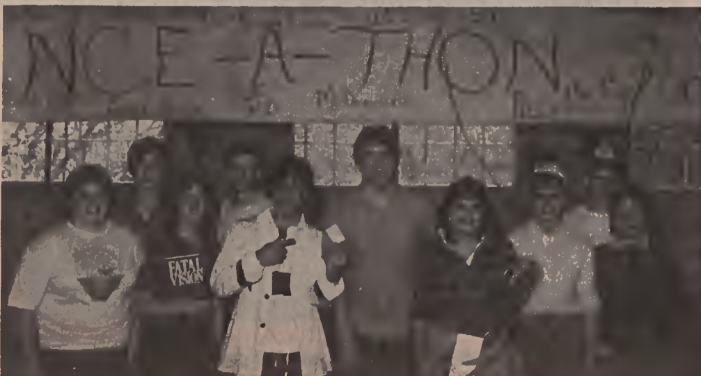
There has to be a morning after, at least for those who went the entire seventeen and a half hours in the recent Iota Alpha Omega Dance-A-Thon.

The committee meets every Thursday at 12:15 p.m. in the President's Dining Room. All Meetings are open to all students.