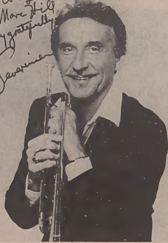
Here's one to keep, for all those who wished they had an autographed picture from Doc Severinsen.

To the Students of Mars Hill Very gratefully Doc Severinsen