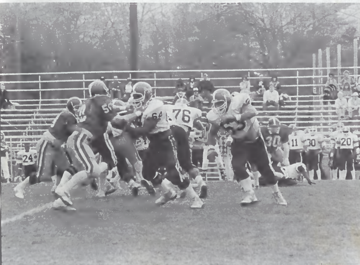
ENSE STOPS G-W 'DOGS ALL DAY