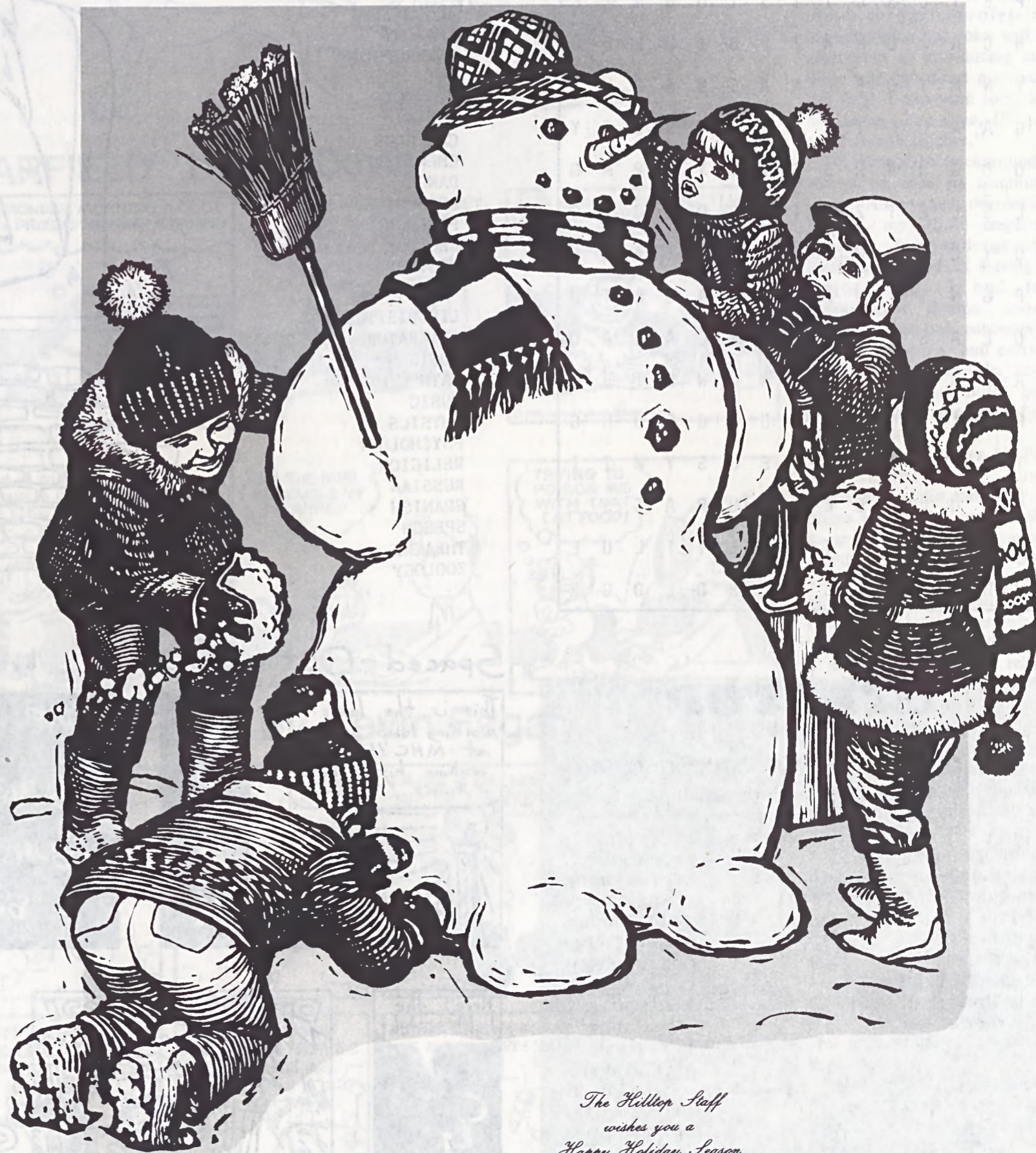
The Hilltop Staff wishes you a Happy Holiday Season

In an attempt to hold the price of the tickets down, we are planning several fund raisers throughout the spring semester. We hope that everyone will attend the Formal. Even if you don't plan on attending then show your support for the rest of the students by helping out. Remember, this college is what it is because of the support that it can be. You've earned