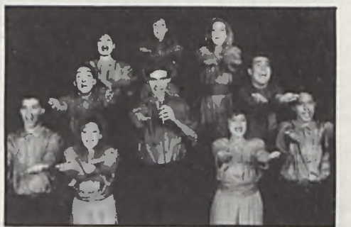
Thursday - Continental Singers