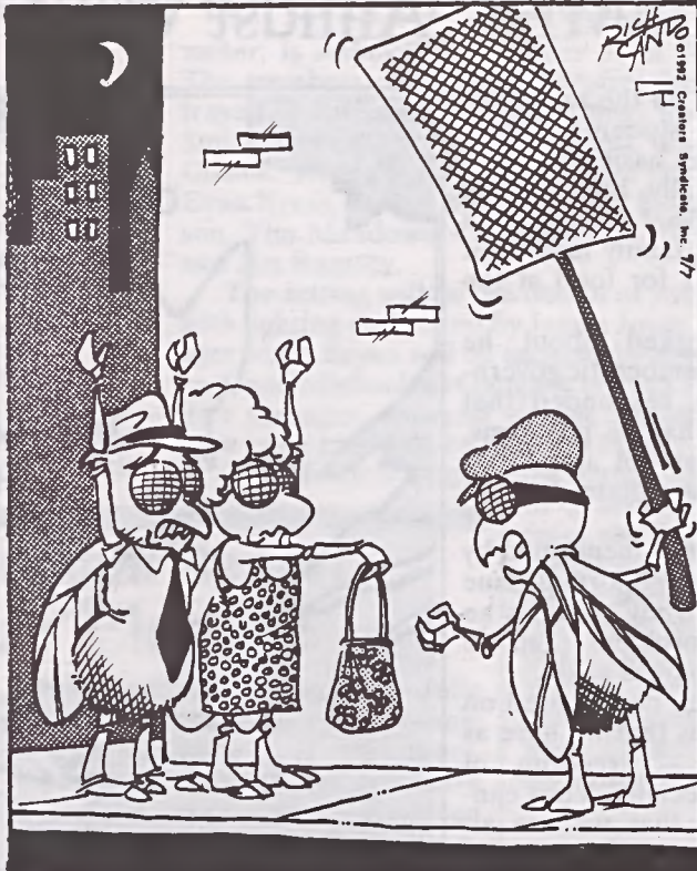
"Nice and easy. I don't want to have to use this."

PAR REPS ABET AGE AKIN CAGE RAM RESONATOR ERODE TOAD TO ZOP EDIT SEE GAL AMUSE AL NEW FIE LA LEGAL DIM REM EMIA MET HE PRES BASIN IMITATIVE ICE TARA ERIN BOS SEAL REST TANT