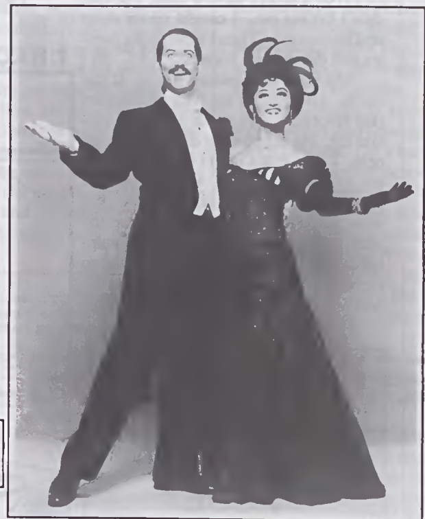
The national tour of "Romance Romance" comes to Moore Auditorium March 4. This two part Broadway show centers on love through the years. MHC student admission is free.

Tickets are for the show are $7 General Admission. Mars Hill students are free with valid ID and it is a green card event.