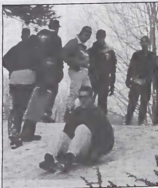
MHC students made their annual pilgrimage to Glbson hill, Feb. 25 and 26, reacquainting themselves with childhood fun.