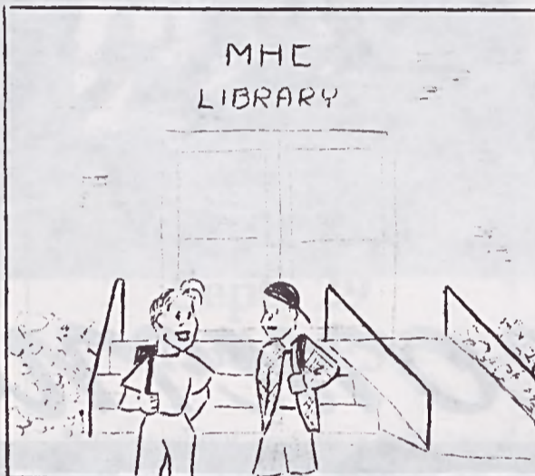
Hey, did you hear about Clinton giving us a new health care plan?