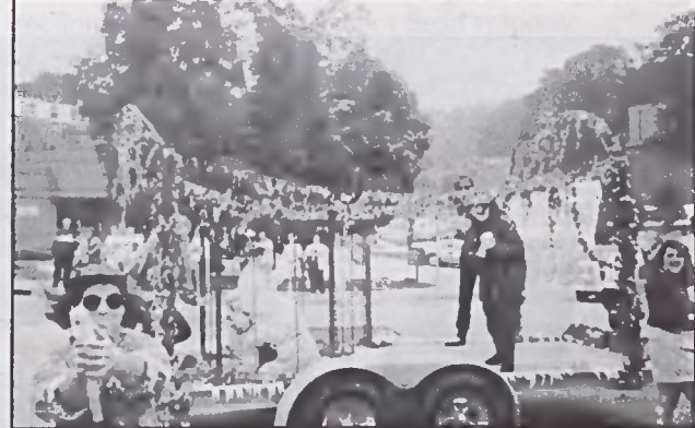
IXA prepare to meet the bulldogs with their jungle float