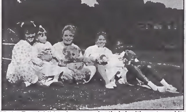
Delta Zeta 'children' prepare for their bedtime story skit