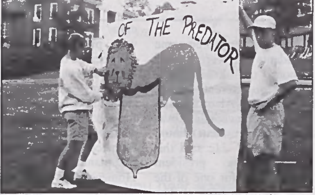
First place DKT decorate the campus with their letters