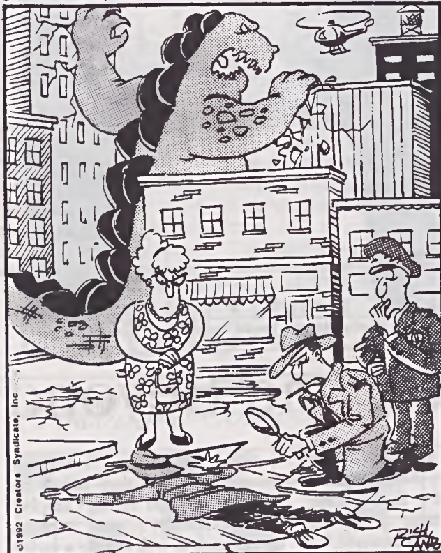
"Well, I don't see any fingerprints. Whoever did this must have worn gloves."