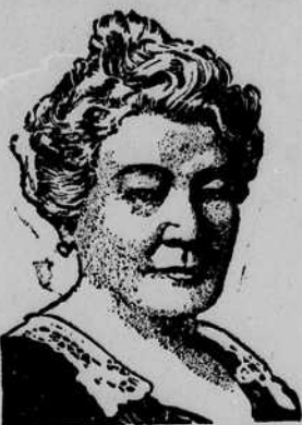
MME. SCHUMANN-HEINK World's Best Beloved Prima Donna Will Be Exclusive Guest Artist of ENNA JETTICK MELODIES National Radio Broadcast EVERY SUNDAY EVENING Through 1930