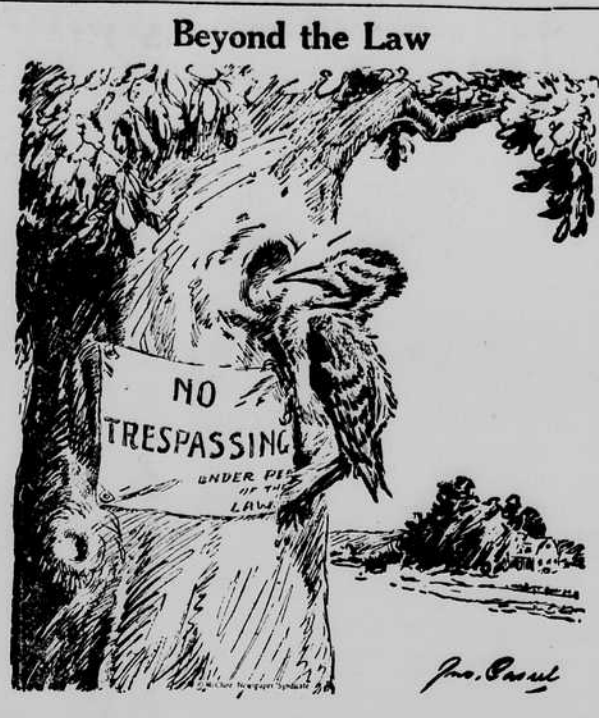
Beyond the Law