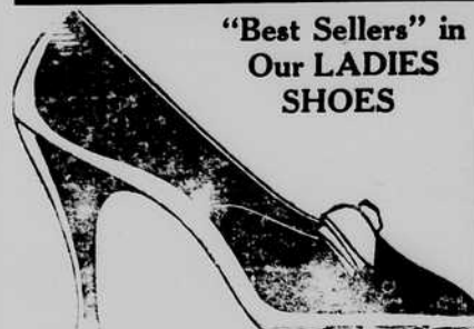
"Best Sellers" in Our LADIES SHOES

With the much heralded "depression" on, even the ladies have turned to "cheaper shoes"—or, might we say, shoes that could be sold for a "cheaper" price. For that is the kind you'll find at COBURN'S. We do not sell "cheap" shoes. We will not sacrifice quality. Here is a group of shoes that will fit every purse. All "best sellers"—price range: