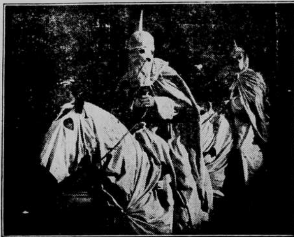
Famous Civil War picture with sound at local Theatre next Wednesday and Thursday.