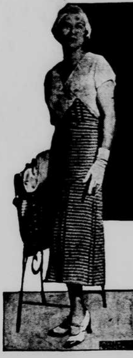
Cottons come to town in smart jacket costumes of new soft tweeds. Stitched pleats and snuff-fitting lines lend interest to this distinctive tailor. The jacket is semicuffed with a scarf collar of white cotton mesh, which is used in the unusual bodice yoke of the dress.