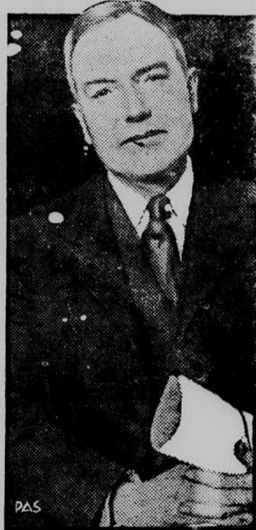
John D. Rockefeller Jr., long a staunch dry, stirred political camps to action in announcing that he "favors repeal . . . prohibition a failure . . . its evils outweighing its benefits."