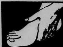
TIRED, ACHING, BURNING FEET?