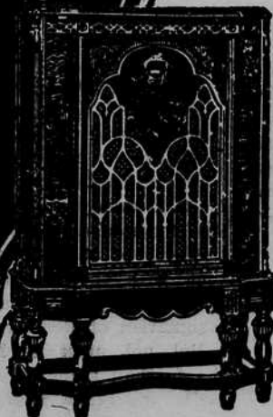
Model 314. Complete with 7 Majestic Tubes and Federal tax paid. $69.50

We will make a surprising offer for your old radio TO BE APPLIED ON THE PURCHASE PRICE OF A NEW