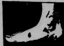
WEAK OR FALLEN ARCHES—FLAT-FOOT