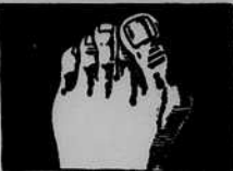
BUNIONS OR CROOKED TOES?

Remember the Date: Friday, Nov. 25th FARBER & JOSEPHSON Weldon, North Carolina