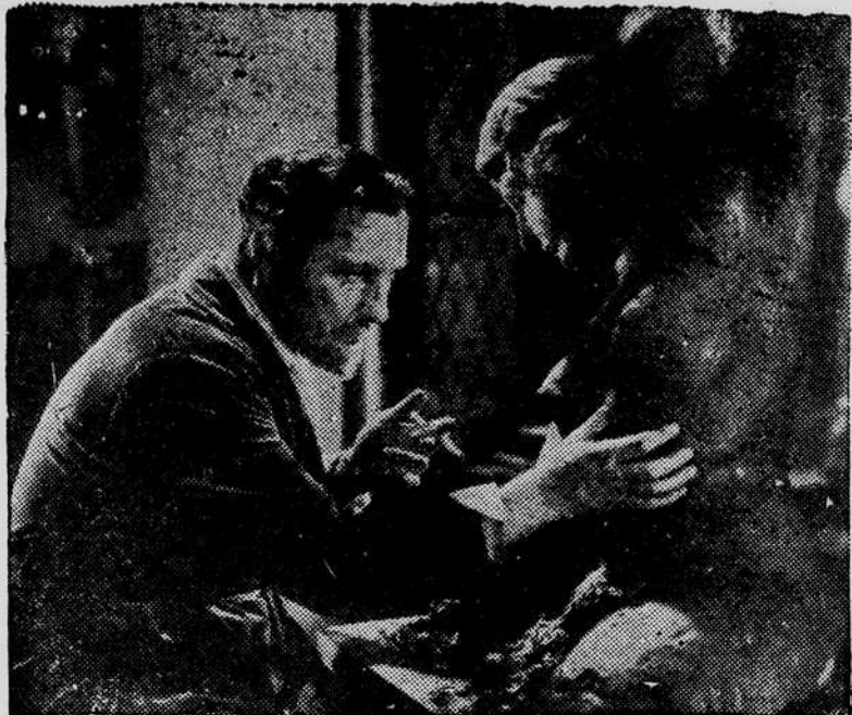
Here we have Lion Atwill, as Ivan Igor, the famous modeler in wax, moulding a museum piece of uncanny realism in "The Mystery of the Wax Museum," which comes to the Imperial next Monday-Tuesday. The picture is all in technicolor.