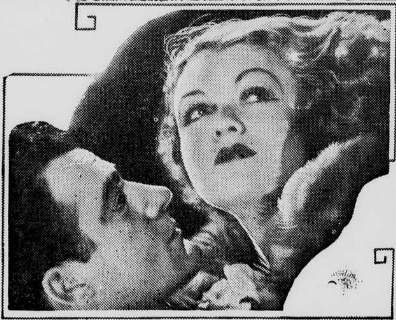
Above is beautiful, alluring and sophisticated Constance Bennett as she appears in her latest picture, "Our Betters," with Gilbert Roland. It is the feature offering of Next Week's Imperial program, and will be shown at the Uptown house Monday-Tuesday.