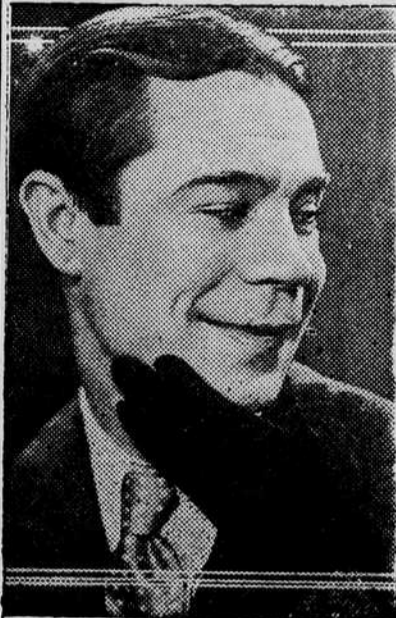
Joe E. Brown, as he appears in his latest comedy, "Elmer the Great", which comes to the Imperial next Thursday-Friday.

Illinois farmers will increase soy bean acreage 25 per cent.