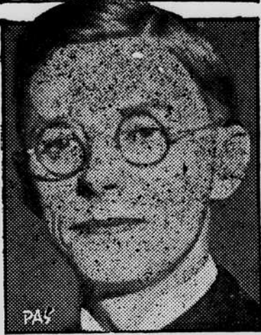
Dr. James Bryant Conant, new President of Harvard, broke a tradition at that university by posing for this photograph and welcoming reporters—a rule Dr. Lowell (retiring) never violated.