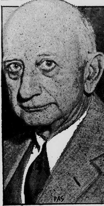
Eugene Black, of Atlanta, Ga., is the new governor of the Federal Reserve Board, succeeding Eugene Meyer, resigned, upon the appointment of President Roosevelt. Mr. Black is the second Southerner to hold this important post, the other being W.P.G. Harding of Alabama.