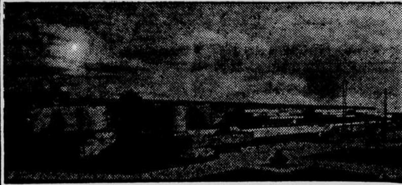
The Agricultural Building is 600 feet long, 100 feet wide and 40 feet high . . . one of the architectural beauties of the Century of Progress World's Fair at Chicago.