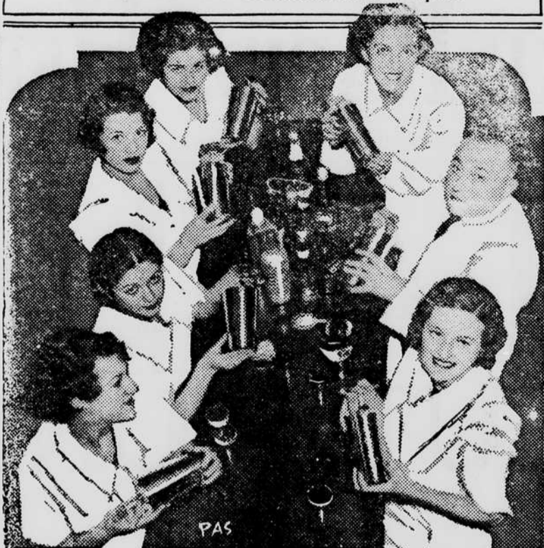
Gone, seemingly forever, are the oldtime bartenders with oiled hair and waxed mustache. Instead, when repeal becomes effective, will be American barmaids, a la' British system. Above is shown a class of girls being taught the art of bartending and cocktail mixing at the Bartender's Institute in New York.