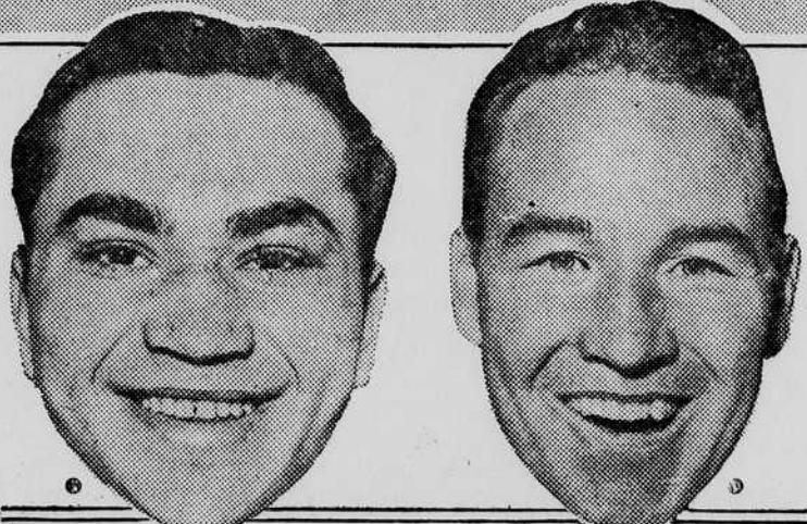
Will Barney Ross, bottom left, light and welter champ, be able again to lace Jimmy McLarnin, bottom right, as he did last May in their Long Island City title bout, scene from which is shown above? Dopesters say "no."

to indicate that this fear is well-founded.