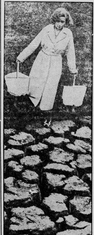
"Down by What Was Once the Old Mill Stream" ought to be the title of this picture, which reveals that England, too, has its drouths. This Southend, England, girl, seeking water, finds dry, heat-cracked mud where a stream rippled but recently.