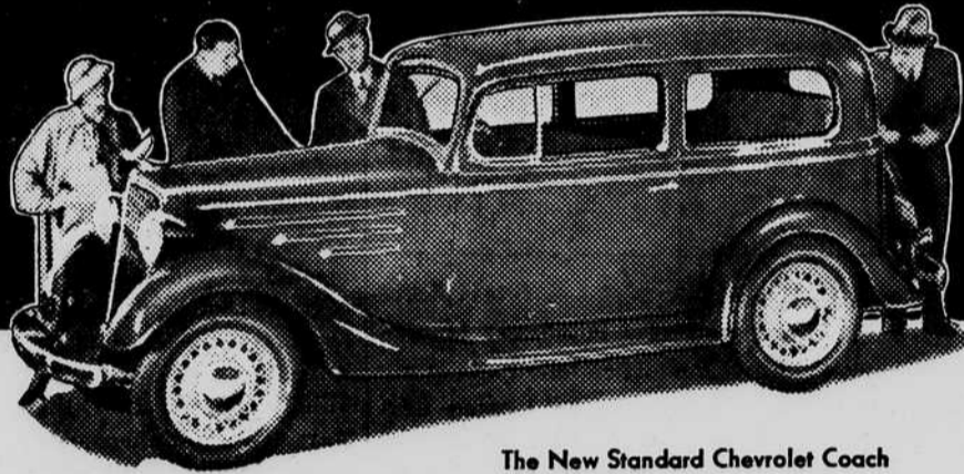
The New Standard Chevrolet Coach