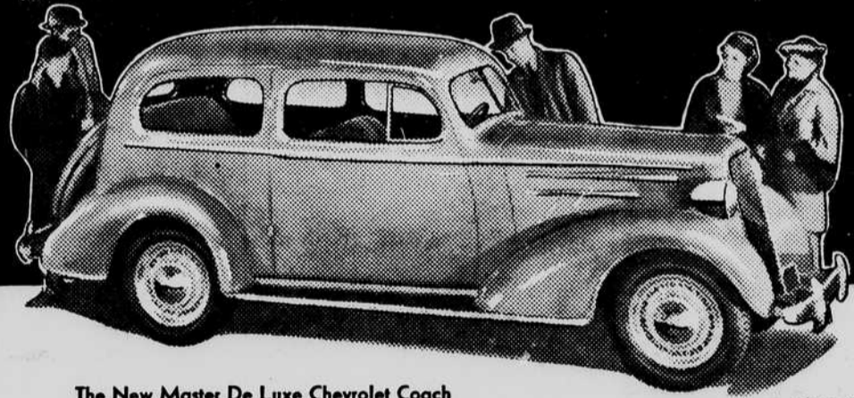
The New Master De Luxe Chevrolet Coach