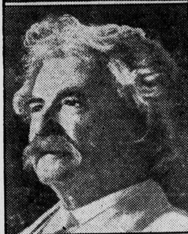
The Mark Twain Memorial Lighthouse, erected on Cardiff Hill overlooking the Mississippi river at Hannibal, Mo., will be lighted for the first time on Jan. 15, when President Roosevelt presses a button in the White House, opening celebration of the centennial of the famed author.

ter and cool. Meantime sift the flour, salt and baking powder, add the yolks of eggs and milk gradually, beating until smooth. Blend the two mixtures, fold in the stiffly beaten egg whites and bake.