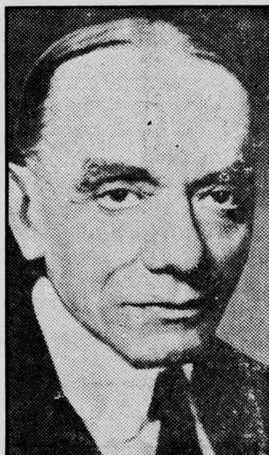
LOUIS McHENRY HOWE

senior secretary and life-long friend of President Roosevelt, who has been near death from bronchial disorders, complicated by heart ailment. Not until his condition was slightly improved did the President leave on his fishing trip.