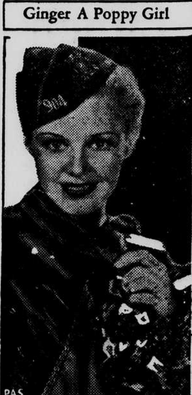
Ginger A Poppy Girl