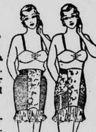
Incorrect Spencer Corset