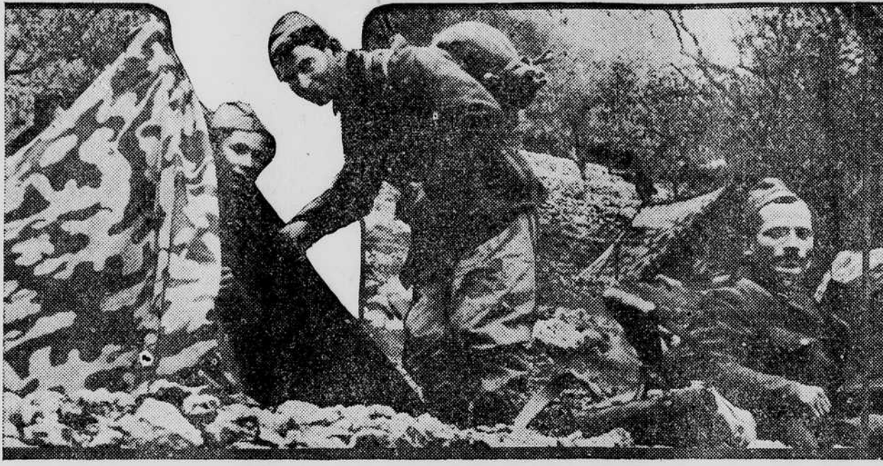
Enemy planes would have a difficult time spotting these Italian tents which are camouflaged the color of the terrain. The tents are erected in Eritrea, not far from the Ethiopian border. The men are awaiting Mussolini's "Go" before starting their invasion.