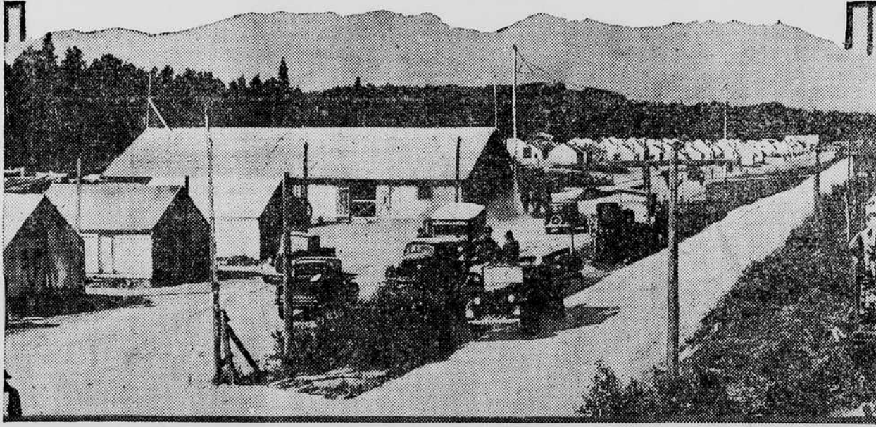
The town of Palmer, being built in Matanuska valley, Alaska, by colonists from the Middle West, is pictured here on a busy day. In the foreground are the administrative headquarters of the Alaska Rural Rehabilitation corporation. The long building is the warehouse which also houses the telegraph and radio offices of the United States army signal corps. Tents of the colonists are to be seen in the background.